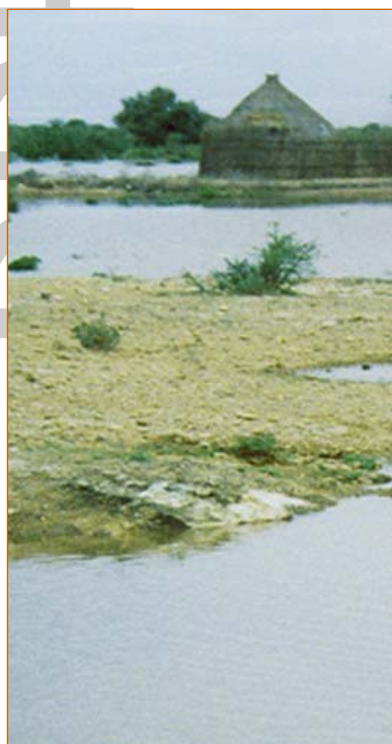
Hailstorm caused damaged in different areas in Tigray, Oromia and Amhara Regions.

In Sekela wereda of West Gojjam 4 localities had hailstorm which damaged 333 hectares of crops from 20-100% and 2 oxen, 1 horse, 1 cow, 1 sheep and 1 heifer were killed. In addition, fertilizers have skyrocketed in price by a difference of Birr 100.